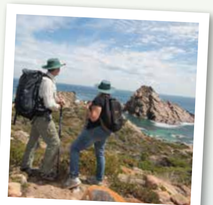
Cape to Cape Track