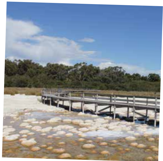
Lake Clifton, Yalgorup National Park

Visit the bird hide on the shores of Lake Pollard and discover how many species of birds visit this special place.