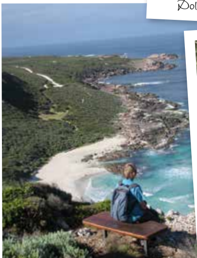
Conto beach, Leeuwin-Naturaliste National Park

The RAC Margaret River Nature Park offers range of accommodation types, facilities and activities in Wooditjup National Park close to Margaret River. parksandresorts.rac.com.au