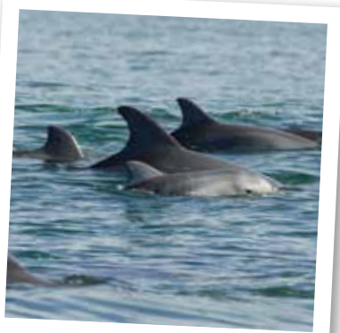
Dolphin Discovery Centre

Bookings and enquiries: dolphindiscovery.com.au