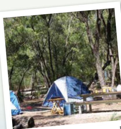
Martins Tank Campground