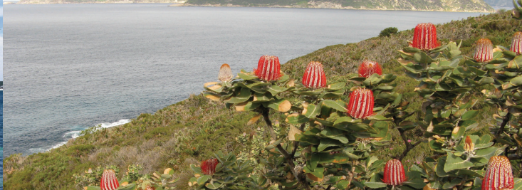
Gull Rock National Park.