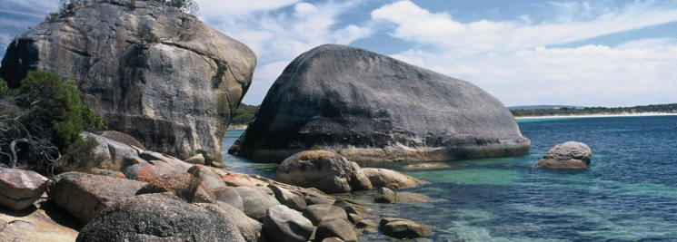
Fairy Rocks, Two Peoples Bay Nature Reserve.