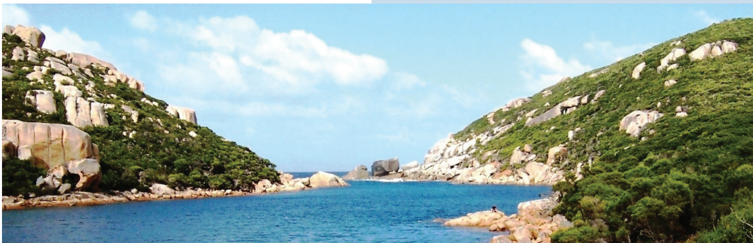
Waychinicup River Inlet.

A complex patchwork of forest, woodlands, wetlands, sedges, granite shrublands and coastal heath covers the landscape. The wetlands and sedgelands are of special importance to bird species, including noisy scrub-birds, which have been reintroduced to this area.