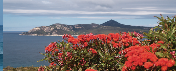
Two Peoples Bay Nature Reserve.